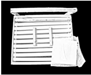
Spacer sticks, prepared pad and rim

* wear protective gear at all times when handling formic acid